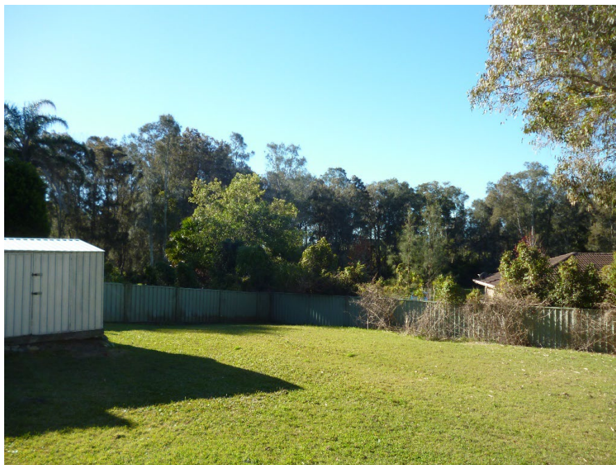
Photo 2: Looking generally north-east from within the site toward forest vegetation.