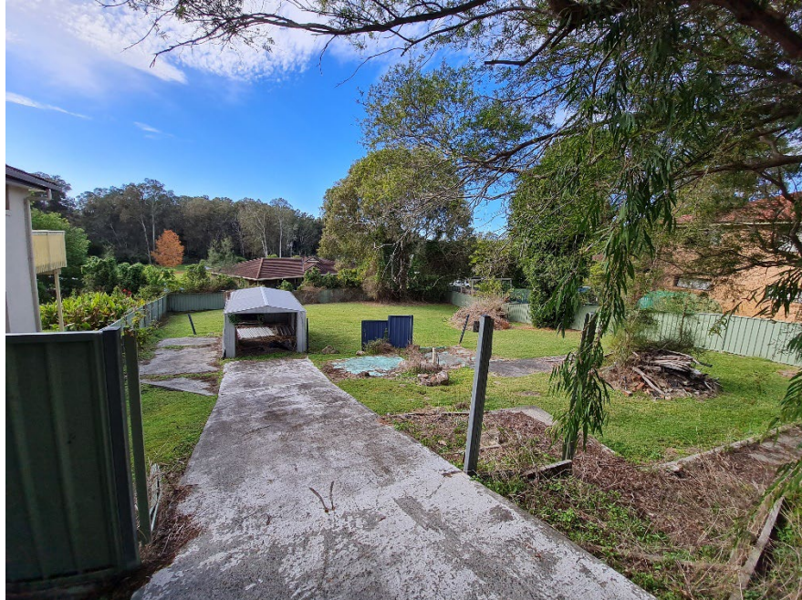
Photo 1: View of the site looking east from the Seabreeze Parade site frontage. Forest vegetation can be seen in the distance.

The following photos show the condition of land on the site.